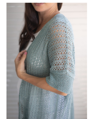
RINCON CAFTAN cardigans