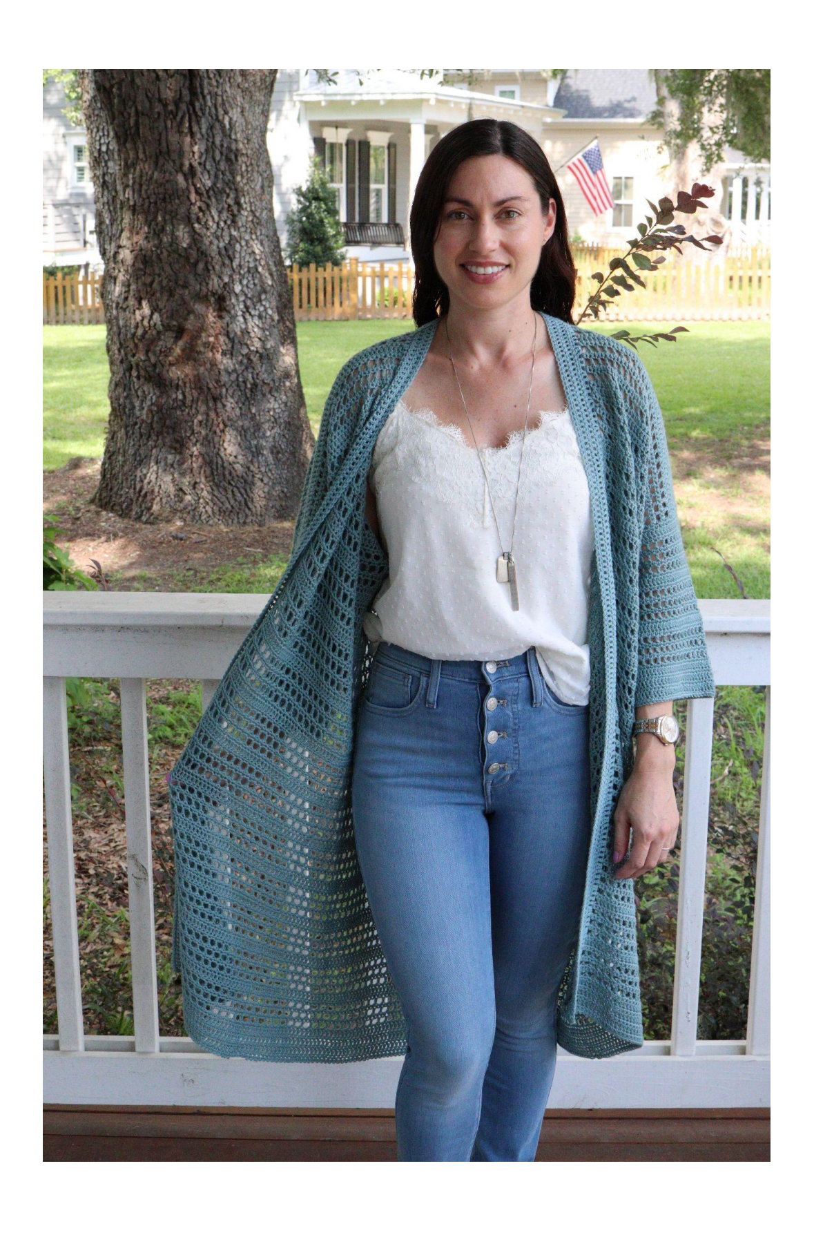
kirstenjoel.com All text, images, & illustrations ©2023 Kirsten Joel For personal use only